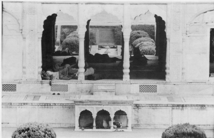
Lahore, Pakistan, 1980