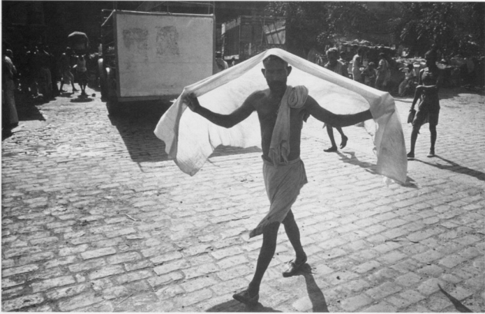
Calcutta, India, 1984