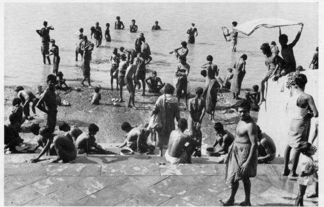
Calcutta, India, 1984