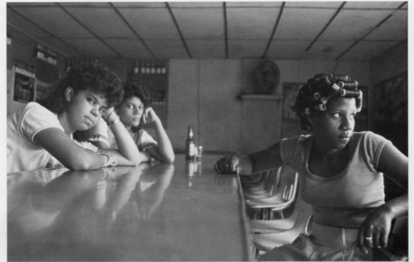
Santo Domingo, Dominican Republic, 1985