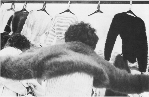
Weinmarkt, Amsterdam, 1985