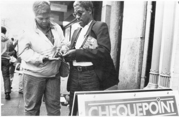
Stationsplein, Amsterdam, 1986