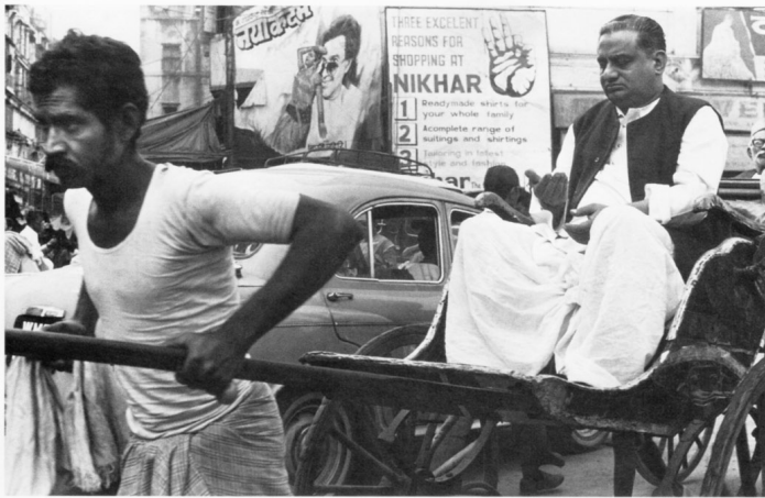
Calcutta, India, 1984