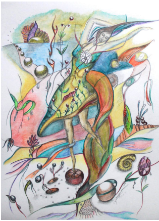
Evolution, 2014 Drawing, watercolor pencil on paper

There are many ways to deal with today's crucial issues. Even if we don't have all the answers yet, let's at least start walking in the right direction. Luckily a lot of people already have in one way or another. For me the right direction is getting to know our true being. Knowing what we're capable of and using the resources and tools given to each and everyone of us to manifest a more efficient, authentic, loving reality. We are fully equipped, we just forgot. I believe that when we get involved in activities that require us to be intuitive, close to our core, we remember again.