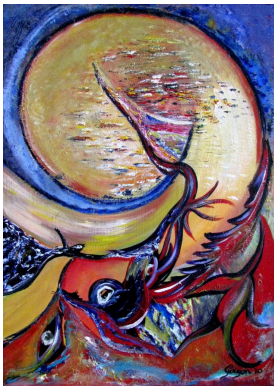
Grips of Illusion, 2010 Acrylic on canvas