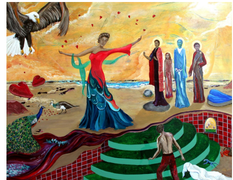
Unconditional, 2012 Acrylic on canvas

Making art is one way of being intuitive. That is why I founded Gougondesign in 2010. A multidisciplinary platform where creativity and spirituality come together. I offer paintings, drawings, digital collages, furniture design, spiritual/art workshops and I write poetry. For me art is a valuable tool to evolve our consciousness. When you create you vibrate with the energies around you and something that wasn't there before in form comes to live. Everything we perceive with our senses is build out of energy.