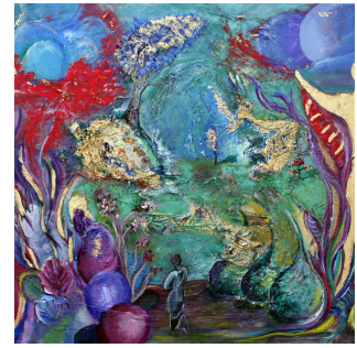
Enchanted Forest, 2012 Acrylic on canvas

Geneviève Gougou, Gougondesign Art. Design. Spirituality. www.gougondesign.com ©Gougondesign 2014