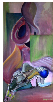
Trust, 2012 Rope, acrylic on canvas

A system of fear and want has crept in on many levels of our societies. It seems we don't really know who we are anymore and what we really need in order to manifest what is truly right for us. We have become too disconnected from ourselves and one another. We stopped listening to our bodies, our environment and our feelings a long time ago. All kind of problems arise. Harshness, crime, health issues, environmental issues, out of control youth, depletion of our natural resources, corruption, wars. We need to stop drifting away from our true necessities and make sure for instance our social, economic, scientific, educational and spiritual developments are in tune with our being. And yes, maybe systems we fear to let go off will have to give way for ones that resonate more with our higher beings.