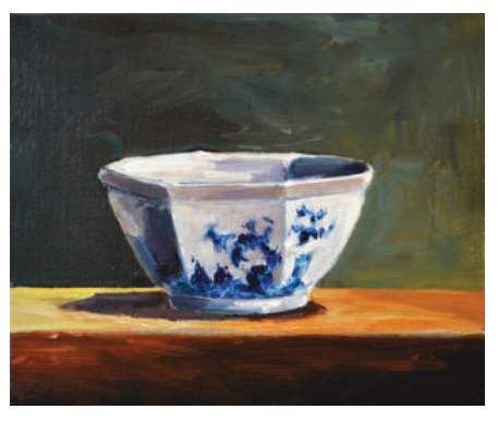
Oriental Bowl Acrylic on canvas / 20 x 25cm