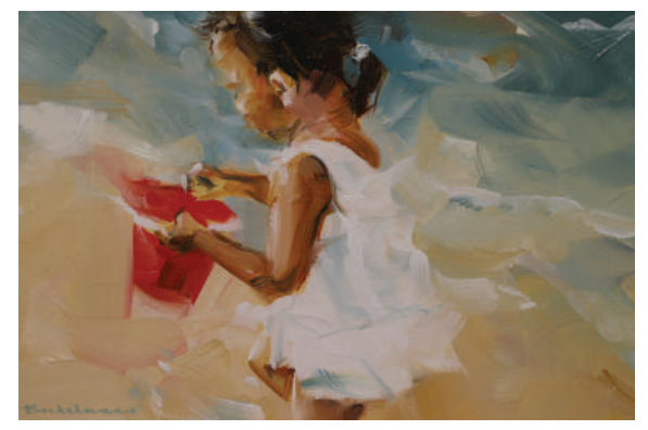
Sunny Days 2 / Oil on panel / 20 x 30cm

Brekelmans is less concerned with replicating the visual details of a subject as he is with capturing its emotional quality. His body of work encompasses a diverse range of themes: portraits, landscapes, beach scenes and studies in movement. His process of applying paint spontaneously to the canvas using brushes and a palette knife is particularly effective in forming the rhythmic compositions seen in several of his works.