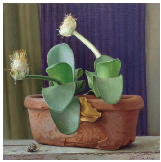
Powderbrush / Oil on linen / 40 x 40cm