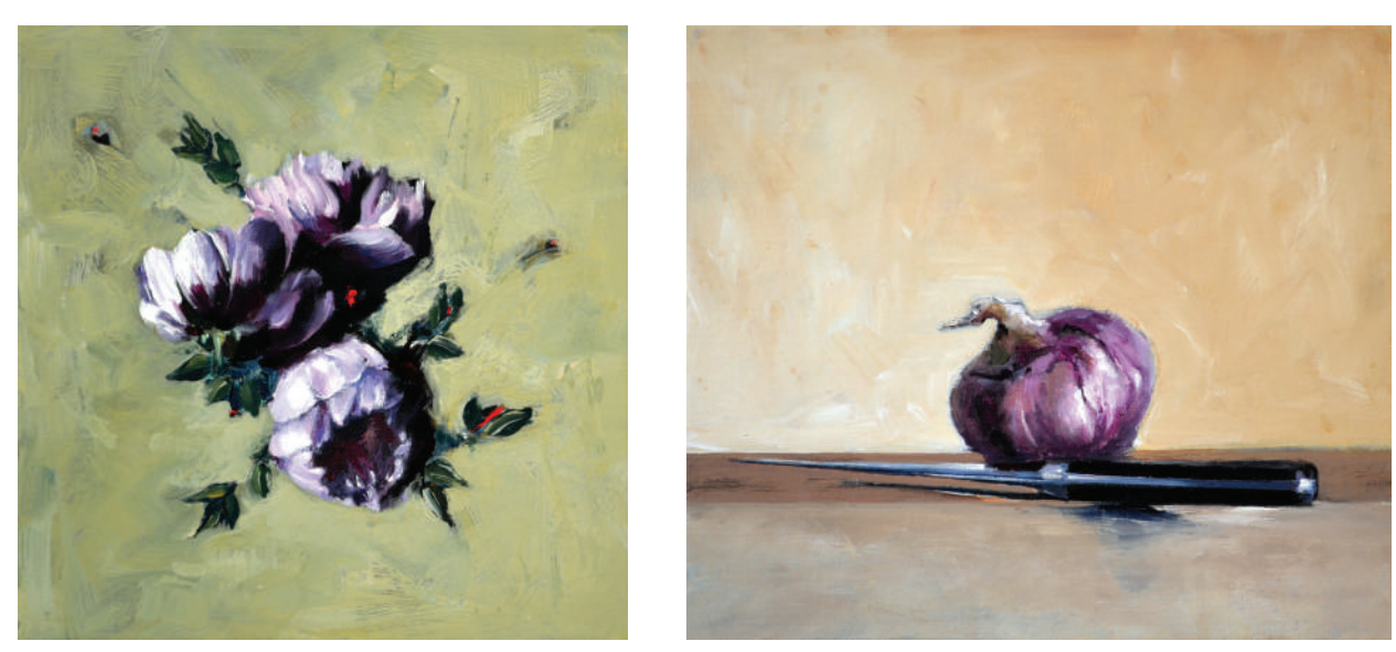
Corsage Acrylic on canvas / 45 x 45cm