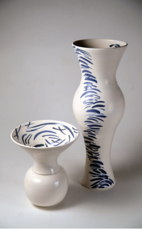
Moonlight On Water / Meandering Landscape