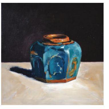
Ginger Jar Acrylic on canvas / 30 x 30cm