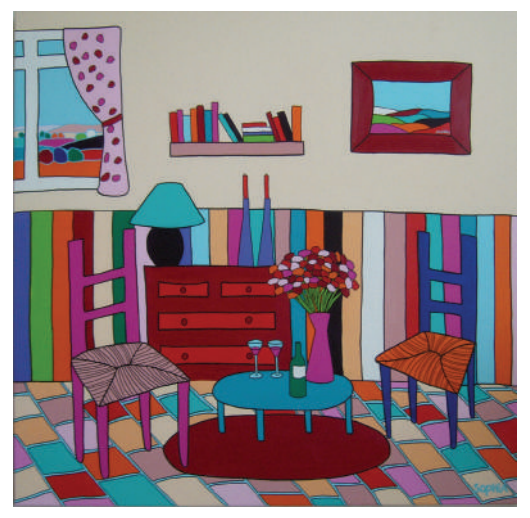
The Room / Acrylic on canvas / 100 x 100cm

Heeres experimented with various styles and techniques during her early studies, but colour and shape have always dominated as the most important elements of her compositions. Heeres brings her subjects to life with the most boisterous, vibrant hues possible. The vivacity of her palette is achieved by applying paint straight from the tube; and she contrasts the visceral use of colour with simplified, asymmetrical shapes to lead the eye into the image.