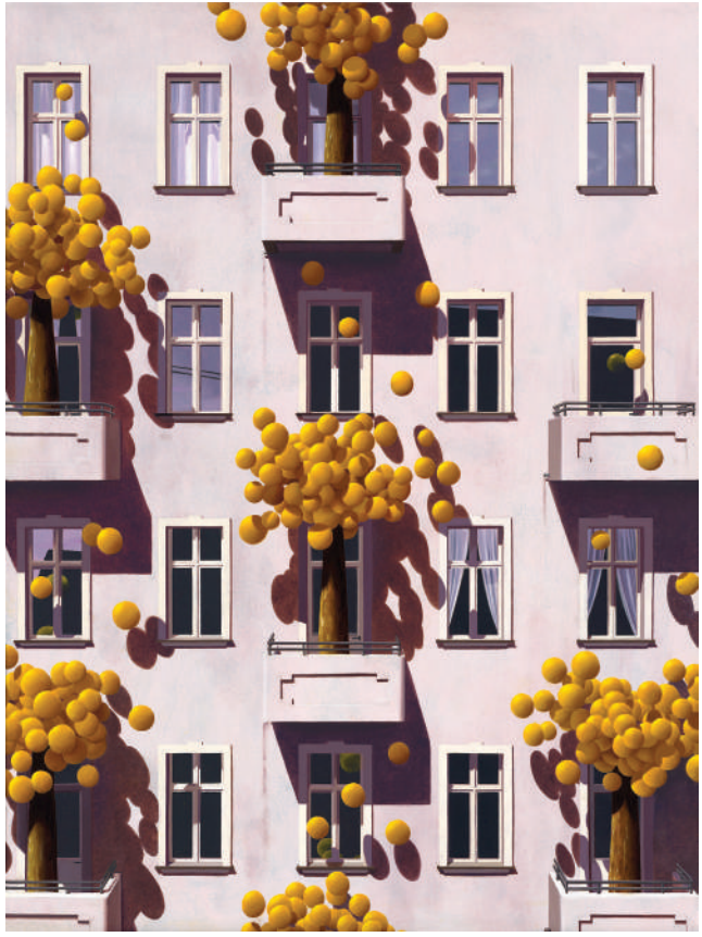
The Shy One Oil on canvas / 81 x 61cm

Working predominantly in landscapes and portraits, Lubeck's paintings explore imagined realities drawn from everyday subjects and sensibilities, all of which are rendered with graphic-like accuracy. Her latest series depicts outlandish landscapes with an emphasis on geometric pattern and texture. While traditional in composition, the minuscule detail paid to each element of the picture is what makes Lubeck's work truly remarkable.