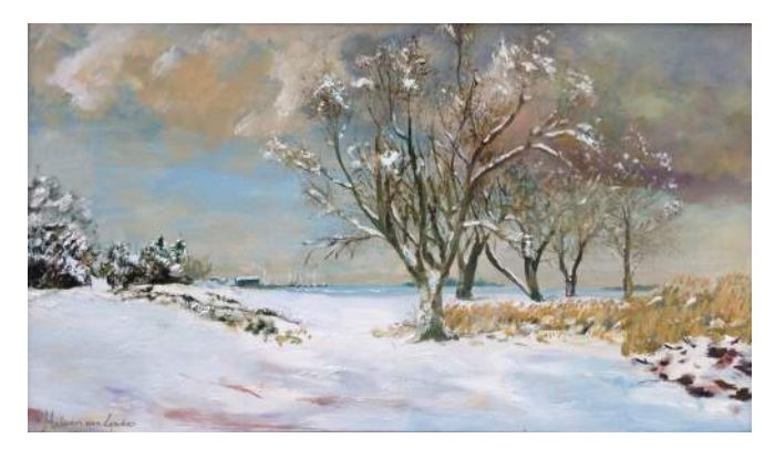
Winter Haven Oil on canvas / 50 x 30cm

Lynden's spontaneous images are strongly influenced by her tendency to work outdoors, 'en plein air.' Whether painting landscapes inspired by her native hometown of Muiderberg or the exotic vistas of Italy, Lynden's work is a study in naturalistic light and colour.