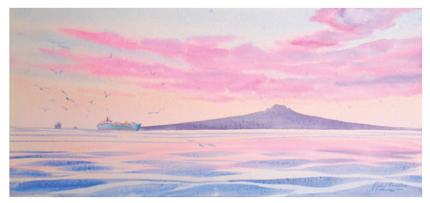
Dawn Arrival / Watercolour on canvas / 78 x 29cm