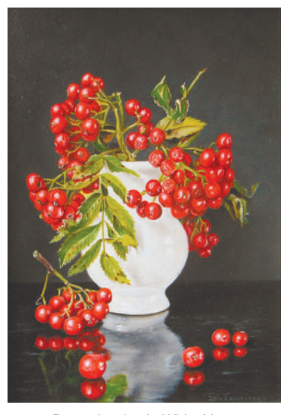
Rowanberries in White Vase Oil on board / 24 x 18cm

The works are truthfully painted, often in a classic, stylish form. They are characterised by a high degree of realism and atmosphere, while a modern look is not shunned.