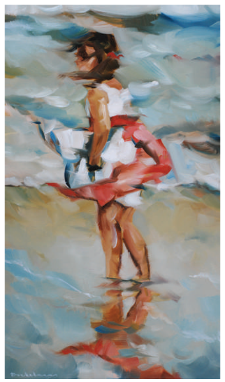
Beach Wind 2 Oil on panel / 52 x 30cm