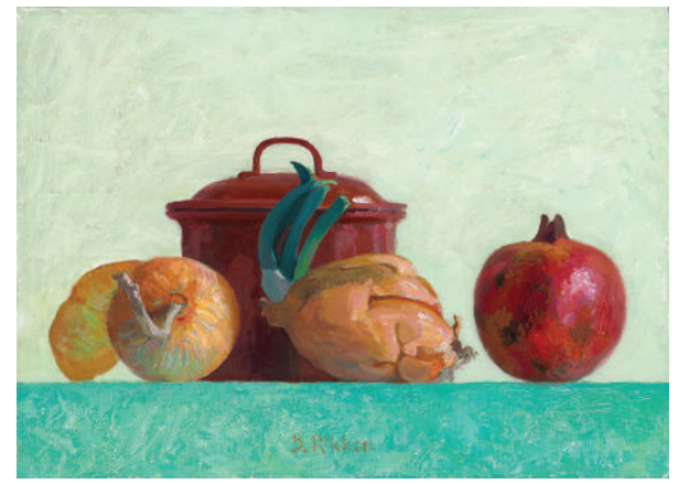
Red Onions and Pot / Oil on panel / 25 x 35cm