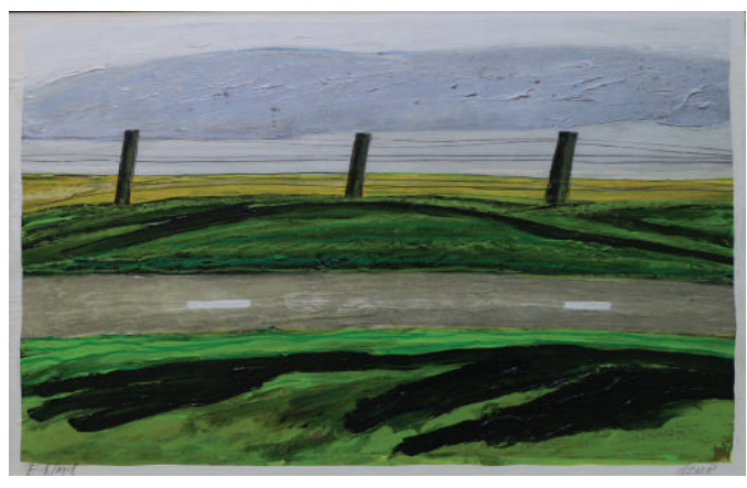
Katwijk - Nooerdwijk '63 / Mixed media on card on board / 50 x 65 cm

Nature's design becomes little more than frenzied strokes of the brush on Nagel's canvas. He finds satisfaction in the gaps of bare canvas between planes of colours, and prefers colours to be laid next to each other rather than over top.