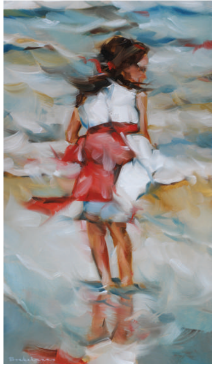
Beach Wind 1 Oil on panel / 52 x 30cm