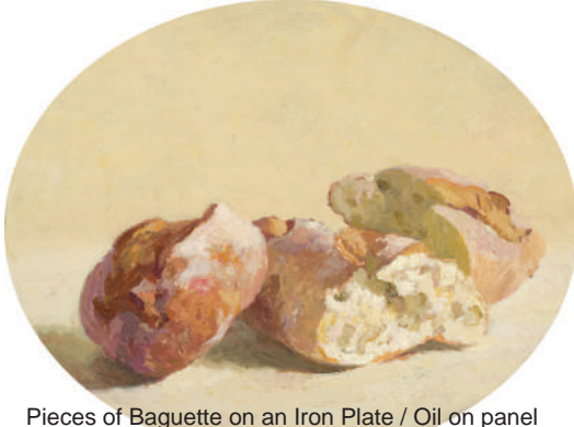
Pieces of Baguette on an Iron Plate / Oil on panel 30 x 25cm