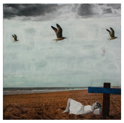
Grey Summer Breeze Paper and acrylic on canvas / 40 x 40cm

Waterman assembles original photography, assorted papers, acrylics, oil, charcoal, ink and pencil in her works. The variety of resources she is able to use has proved indispensable to Waterman, who says the biggest challenge the collage medium posed was its unforgiving lack of transparency.