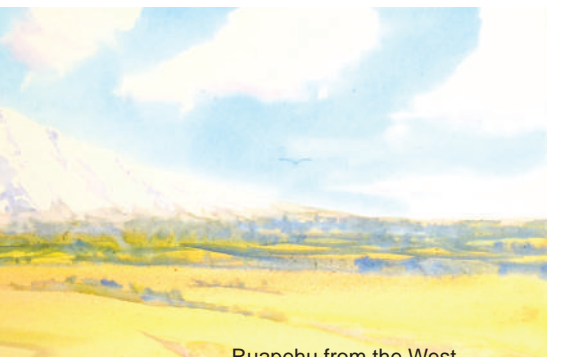
Ruapehu from the West Watercolour on canvas / 78 x 29cm