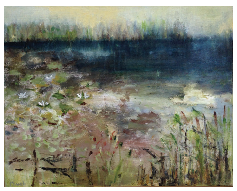
Waterlillies / Acrylic on canvas / 50 x 50cm

For many years Minoli has been established as a well-known as a painter of horses, but these animals are not her only subject by far. In the summertime, Minoli finds her inspiration in the beautiful Dutch landscape and cityscapes. The dunes, the sea and wind mills are found repeatedly in her body of work.