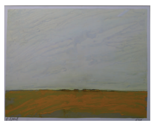
Het Strand '74 / Mixed media on card on board / 50 x 65 cm

His panoramas are instilled with a strong sense of sentimentality, as many of the vistas he paints are fondly recalled from the artist's youth.