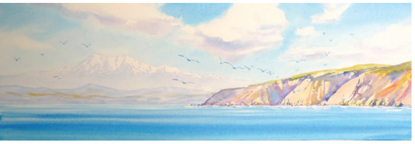
Looking South After Leaving the Tory Channel / Watercolour on canvas / 78 x 29cm