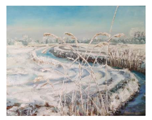
Snow Landscape at Naardermeer Oil on canvas / 60 x 50cm