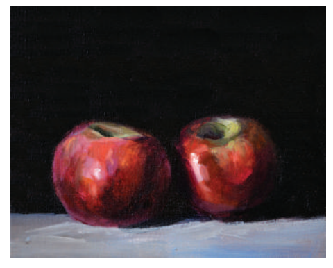
Classic Light #1 Acrylic on canvas / 20 x 24cm

The viewer is thereby invited to witness the artist's search for the essence of the ultimate composition. By continually stimulating and setting the subject of still life under different levels of perception, Kuijpers is continuing a long tradition of Dutch painting within a contemporary context.