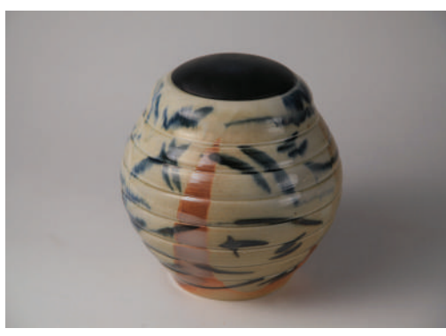
Anagama fired vase

In her cultural studies she found that detail and attention to everyday objects, utensils and rituals elevated her pieces into everlasting works of art while still retaining their fuctional use. Her work includes domestic ware as well as exhibition pieces.