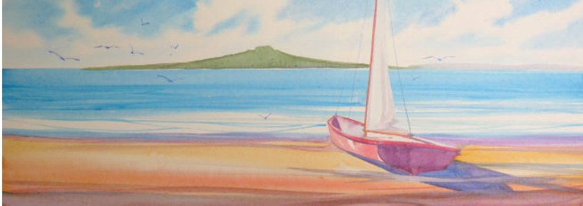
Summer - Takapuna Beach / Watercolour on canvas / 78 x 29cm

Memelink's paintings emphasize the beauty and escapism of New Zealand nature. The fluid ease of his brushwork renders familiar leisure spots and mountain ranges with rich, luminous colour and tangible mood.