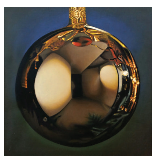
Santa / Oil on canvas / 80 x 80cm

Wijnhoven's subjects are a diverse mixture of the surreal and satirical, as well as more straightforward everyday scenes and still life. Many of his paintings convey an impressive hyper-realistic standard. No matter how simple the compositions may appear, Wijnhoven's works often possess meanings deeper than what is immediately visible on the surface.