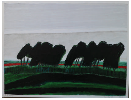
Ter Aar '83 / Mixed media on card on board / 50 x 65 cm