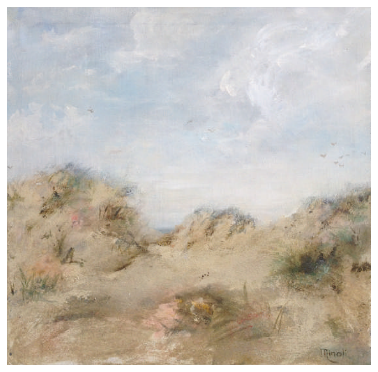
Blonde Dune / Acrylic on canvas / 40 x 50cm

Her paintings are predominantly created with acrylic on canvas, though she also experiments with unconventional mediums such as sand and beeswax. Her beloved drawings of the nude female form have long been made with reed pen and ink. These sketches are similar to another technique she enjoys, Japanese 'sumi-e' or ink wash painting.