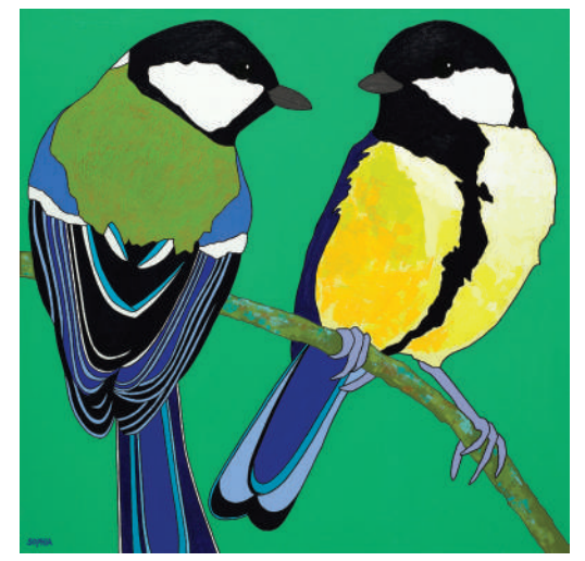
Koolmees / Acrylic on canvas / 100 x100cm

Heeres gravitates towards typically Dutch cityscapes and landscapes, but also paints nature and people. In her latest works, Heeres' subjects are pared down to their simplest forms and flattened with smooth planes of colour and thick black outlines. Her work explores the interplay between shape, colour and lack of depth; combined, they create a strong emotional resonance on the canvas.