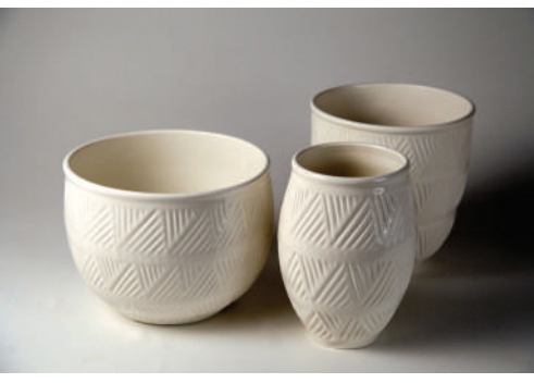
White on white carved bowl / Porcelain