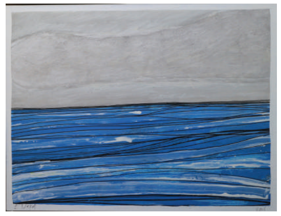
Noordwijk '52/ Mixed media on card on board / 50 x 65 cm

Nagel uses acrylic, gouache, aquarelle, ecoline, ink, oil pastels, oil crayon, and pencil. He works by letting paint dry completely on the canvas before adding more layers, and finds oil paint disruptive to his particular process. Nagel works to avoid the unpredictability of wet colours interacting of their own accord; to him, the visibility of his technique in a painting is as intrinsic as the technique itself.