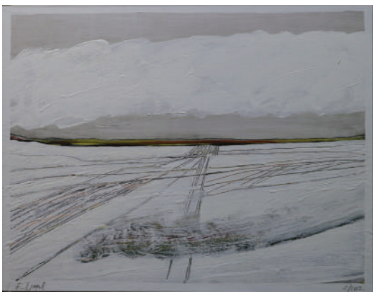
Haarlemmermeer '67 / Mixed media on card on board / 50 x 65 cm