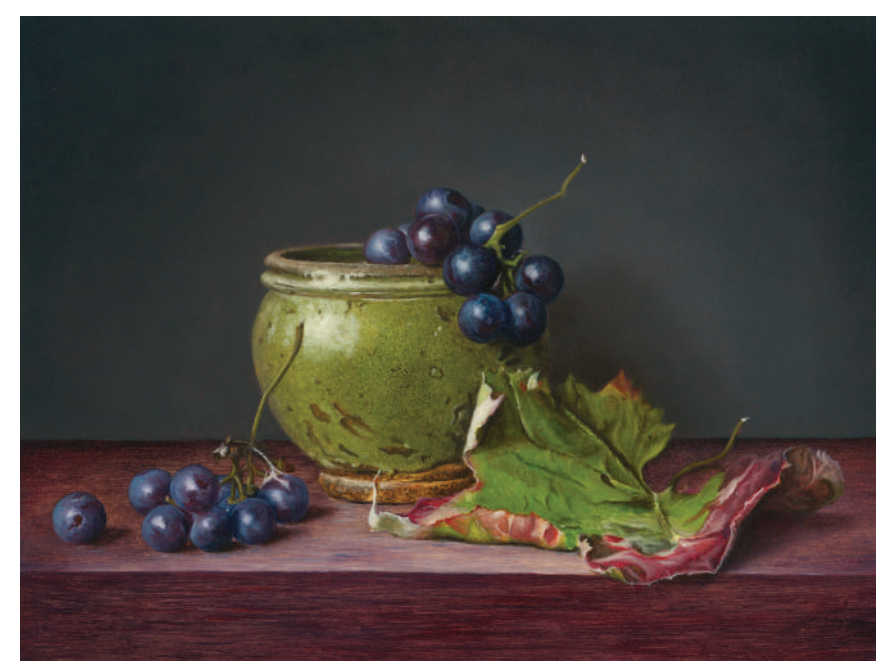
Jar with Grapes and Leaves / Oil on board /18 x 24cm