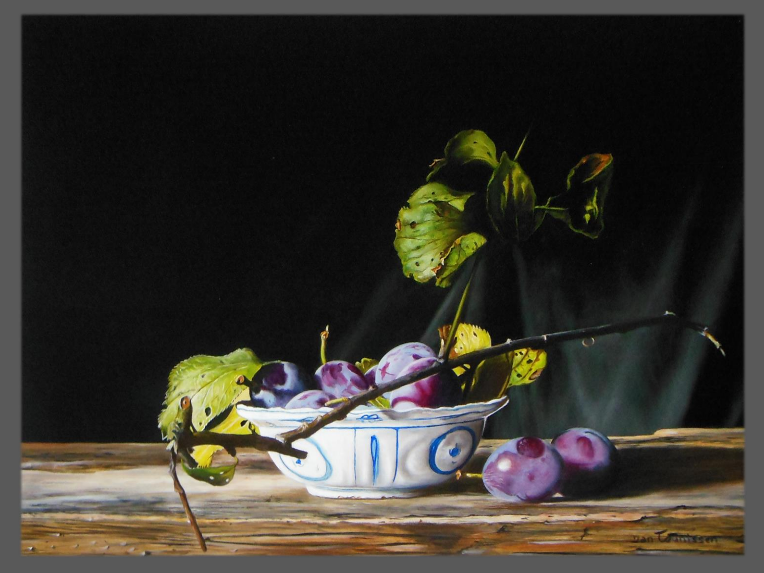
Plums and branch for Chinese dish (30 x 40 cm)