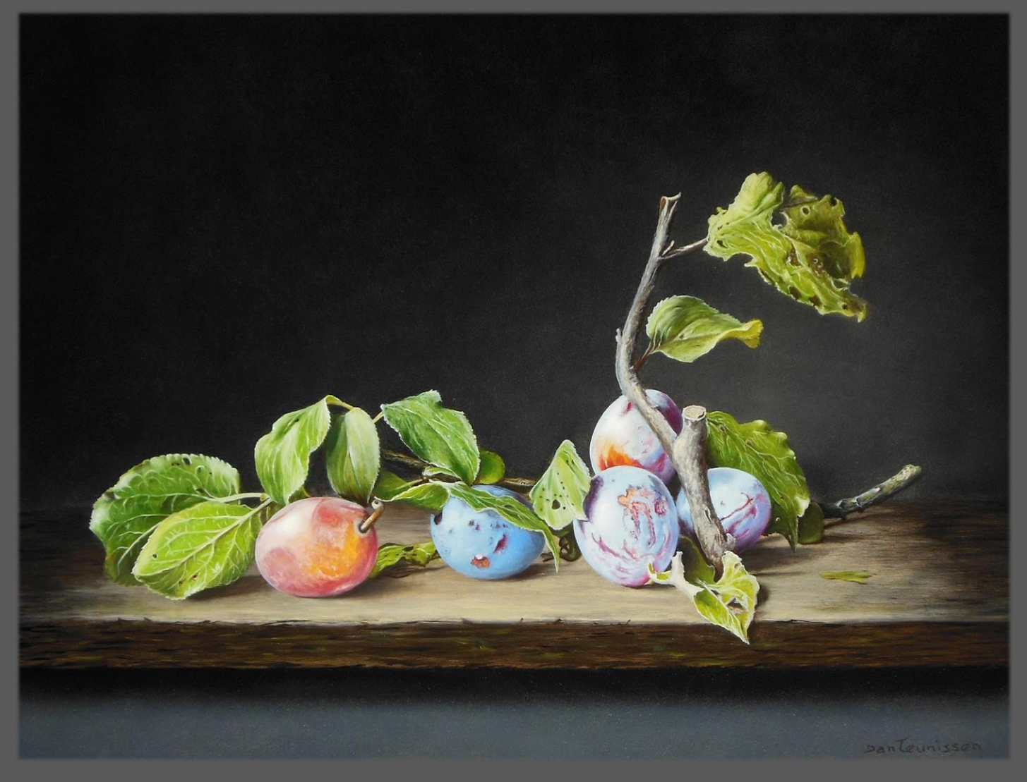
Still-life with plumps and twig (30 x 40 cm)