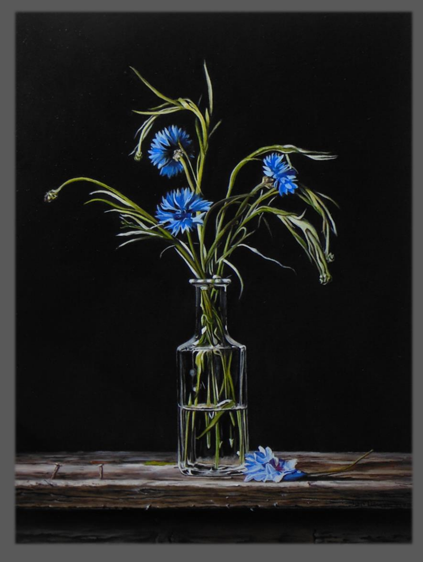
Cornflowers (40 x 30 cm)