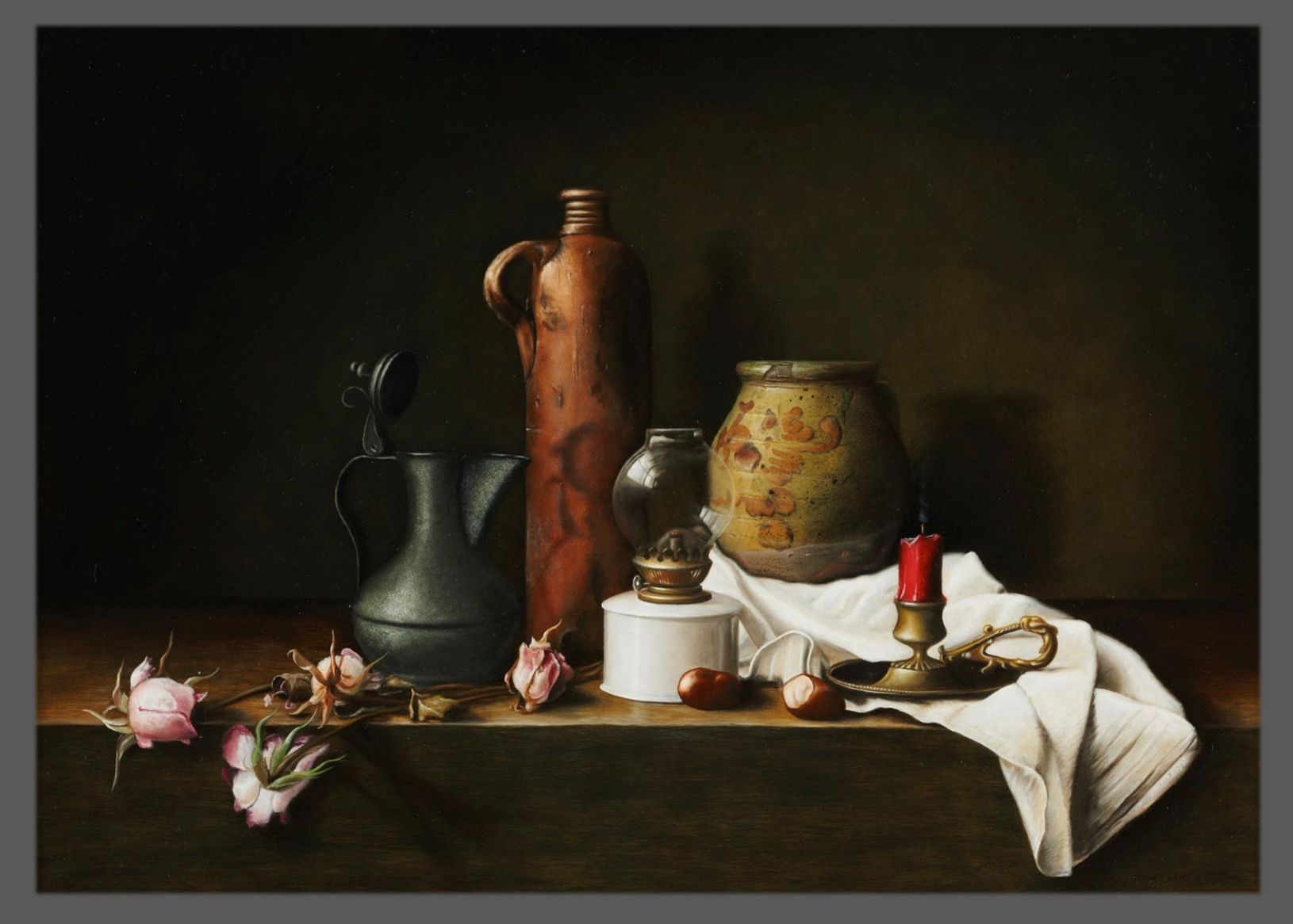
Still-life with candle and dry roses (43 x 60 cm)