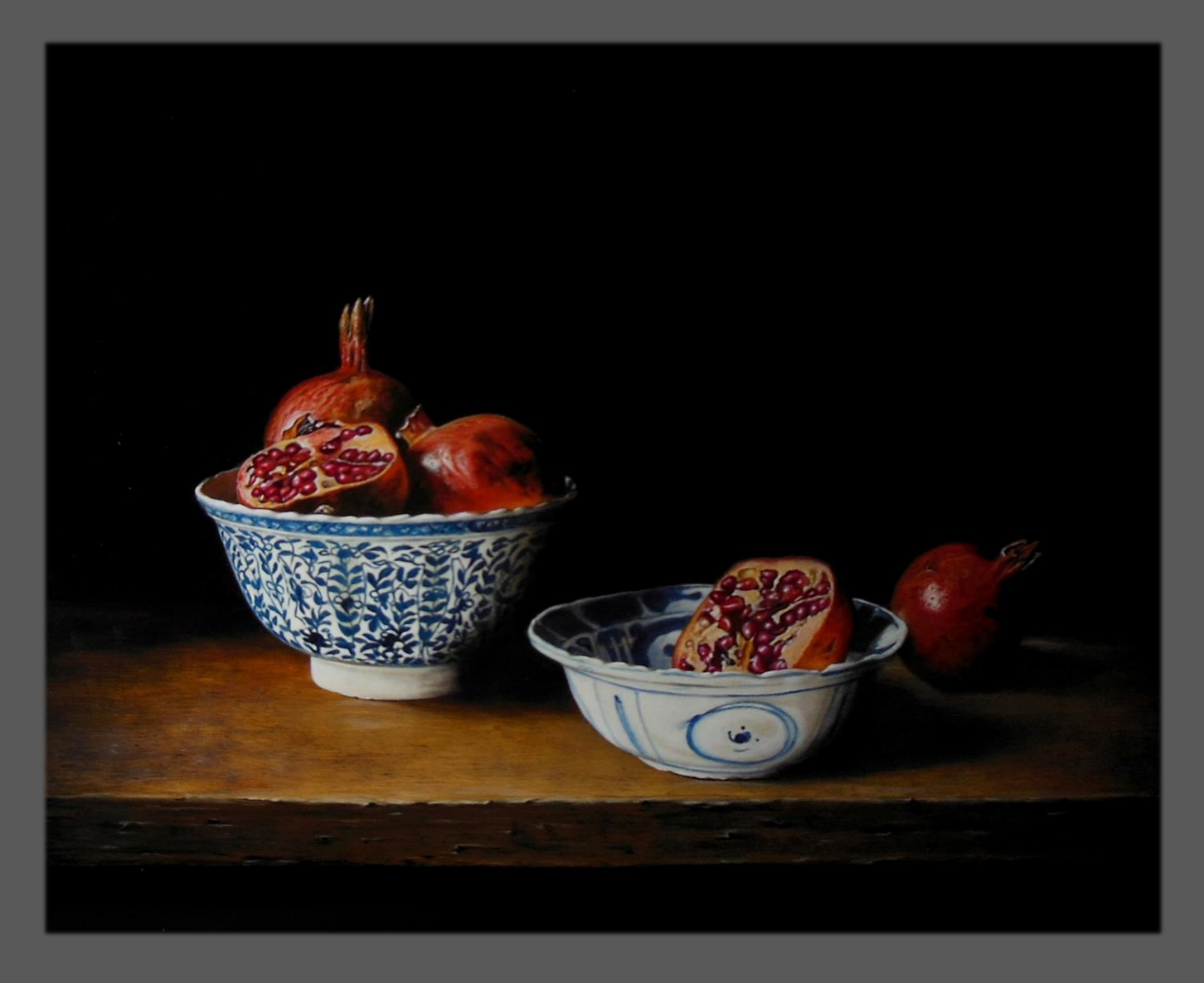
Chinese bowl with pomgranates (40 x 50 cm)