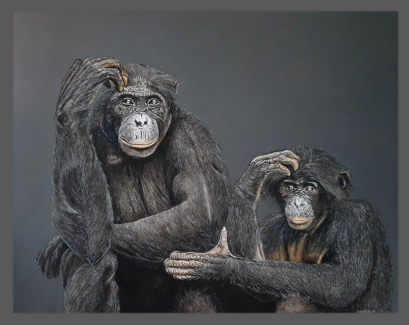
Mother and child Bonobo (55 x 70 cm)