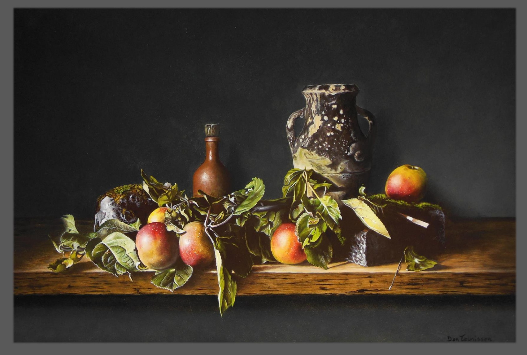
Still-life with apples mossy stone and jar (40 x 60 cm)