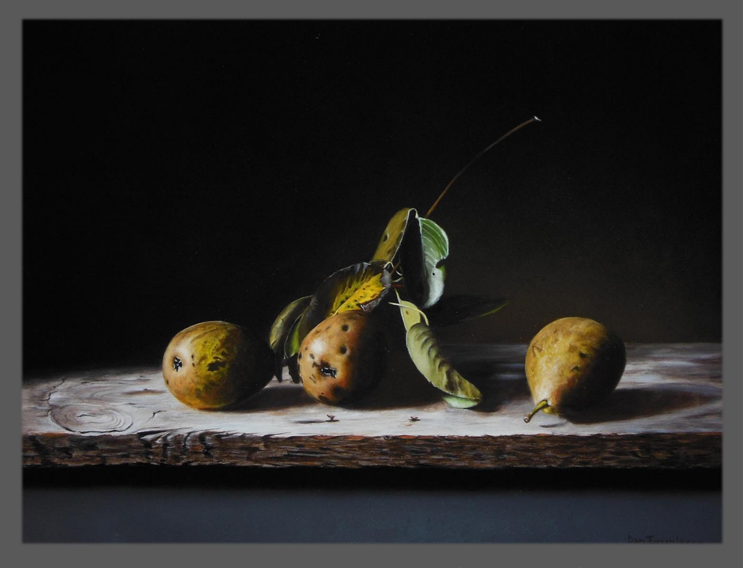
Pears-trio at dark sphere (30 x 40 cm)