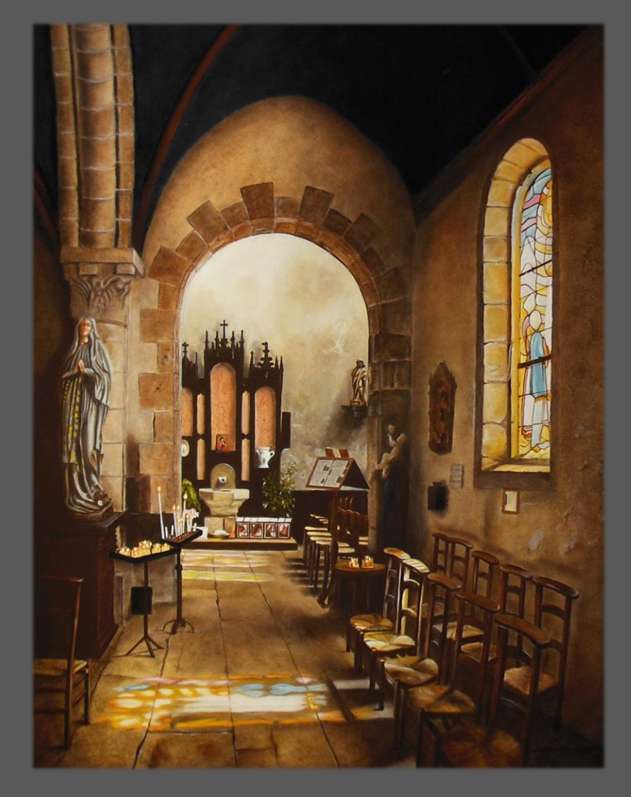
Church interior French island of Batz (Brittany) (70 x 53 cm)