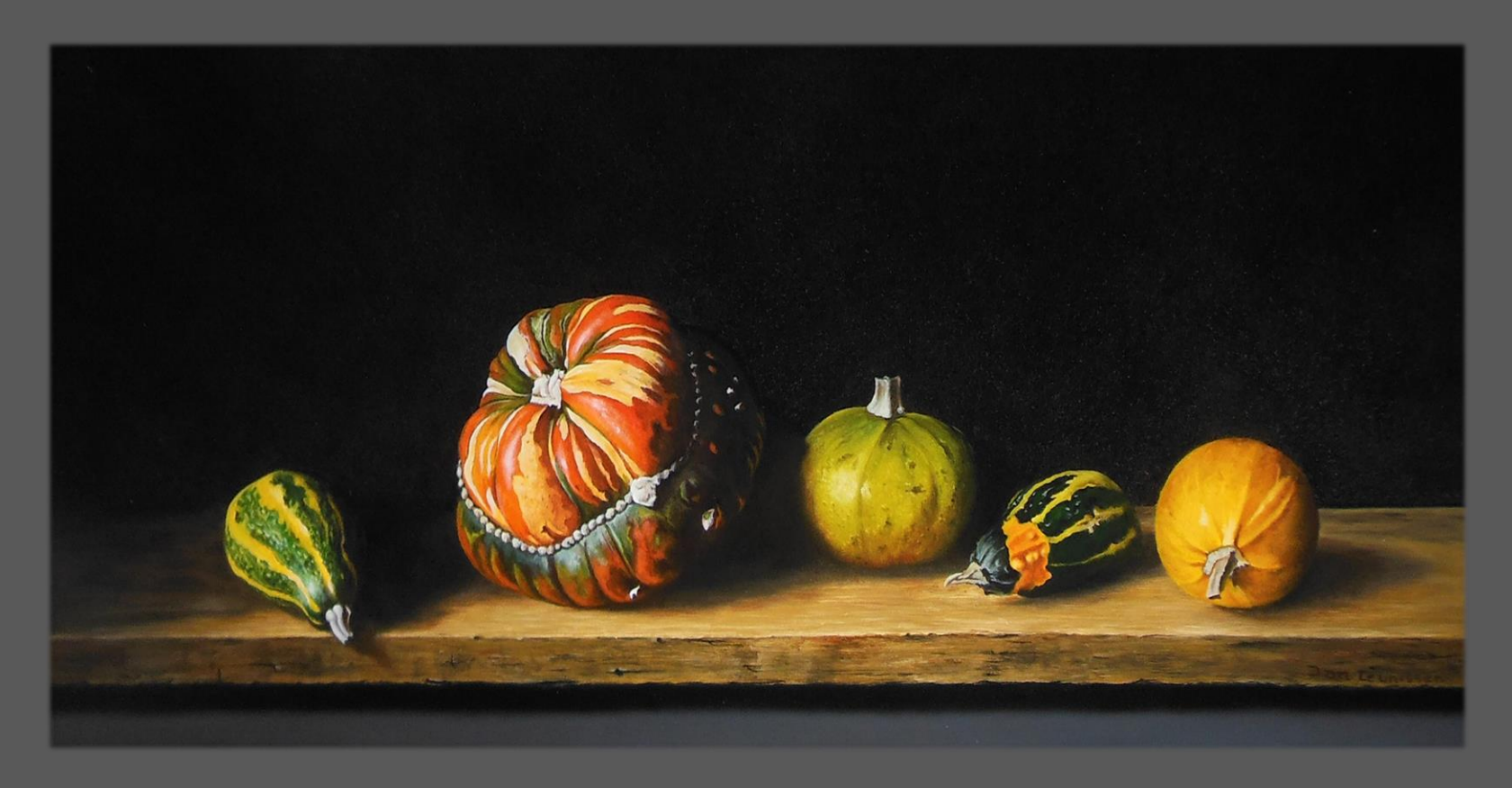
Still-life with pumpkins (40 x 80 cm)