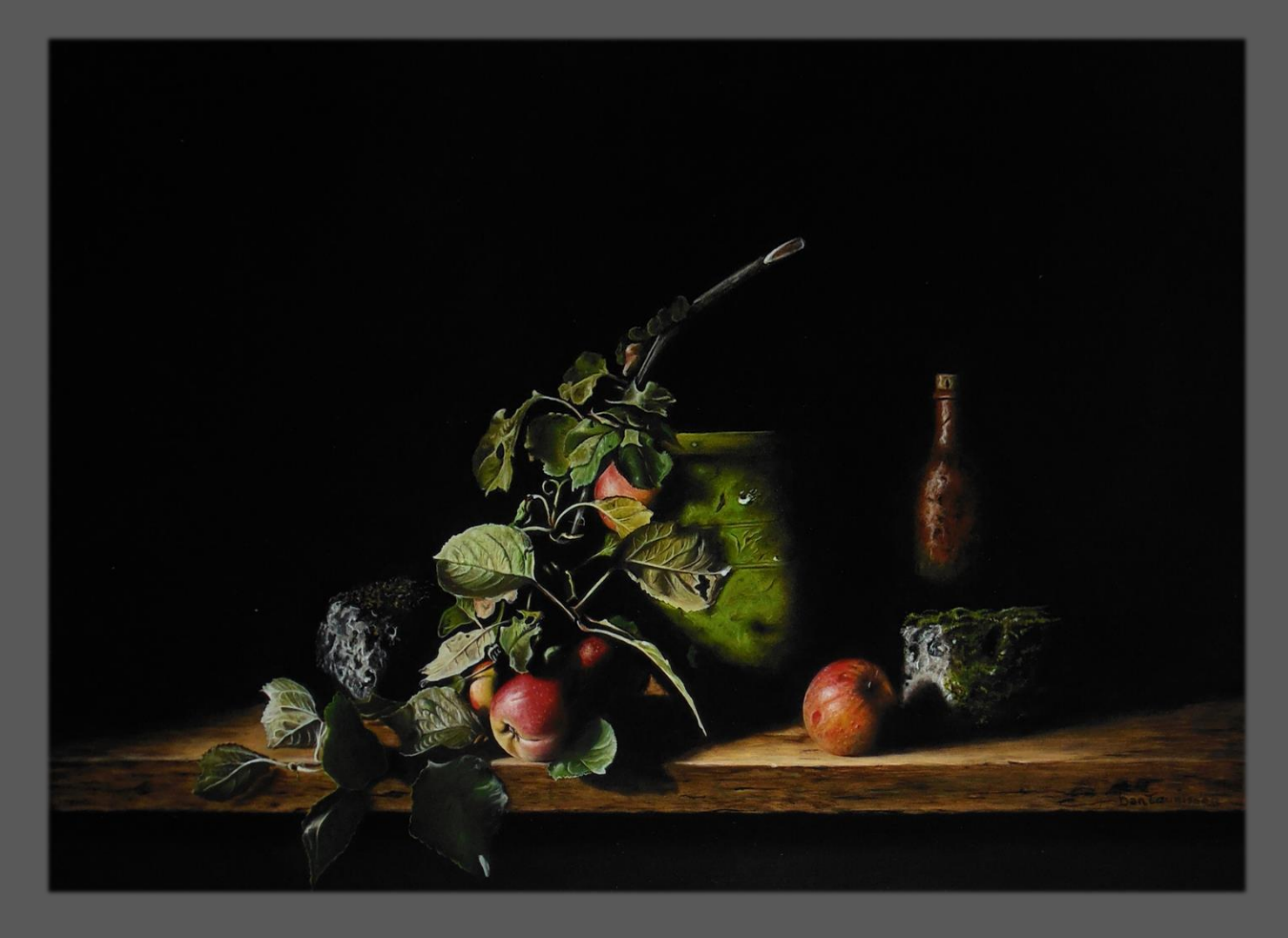
Still life with apples and jug with green algae (50 x 70 cm)