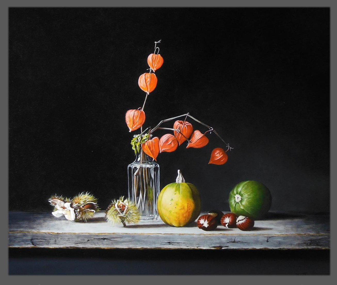
Still-life with lanterns and chestnuts (50 x 60 cm)