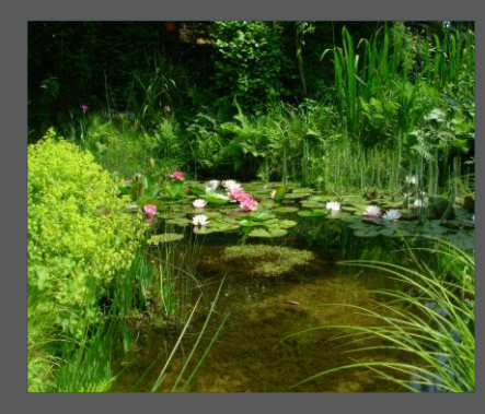
Home and garden