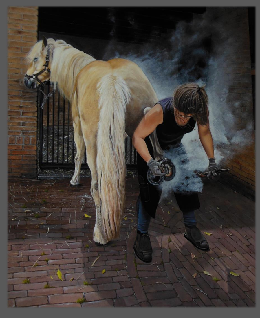
Square studded (60 x 50 cm)