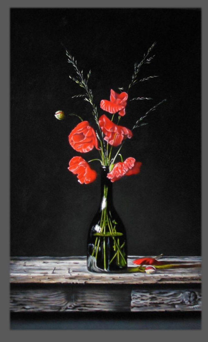
Poppy flowers in green bottle (50 x 30 cm)