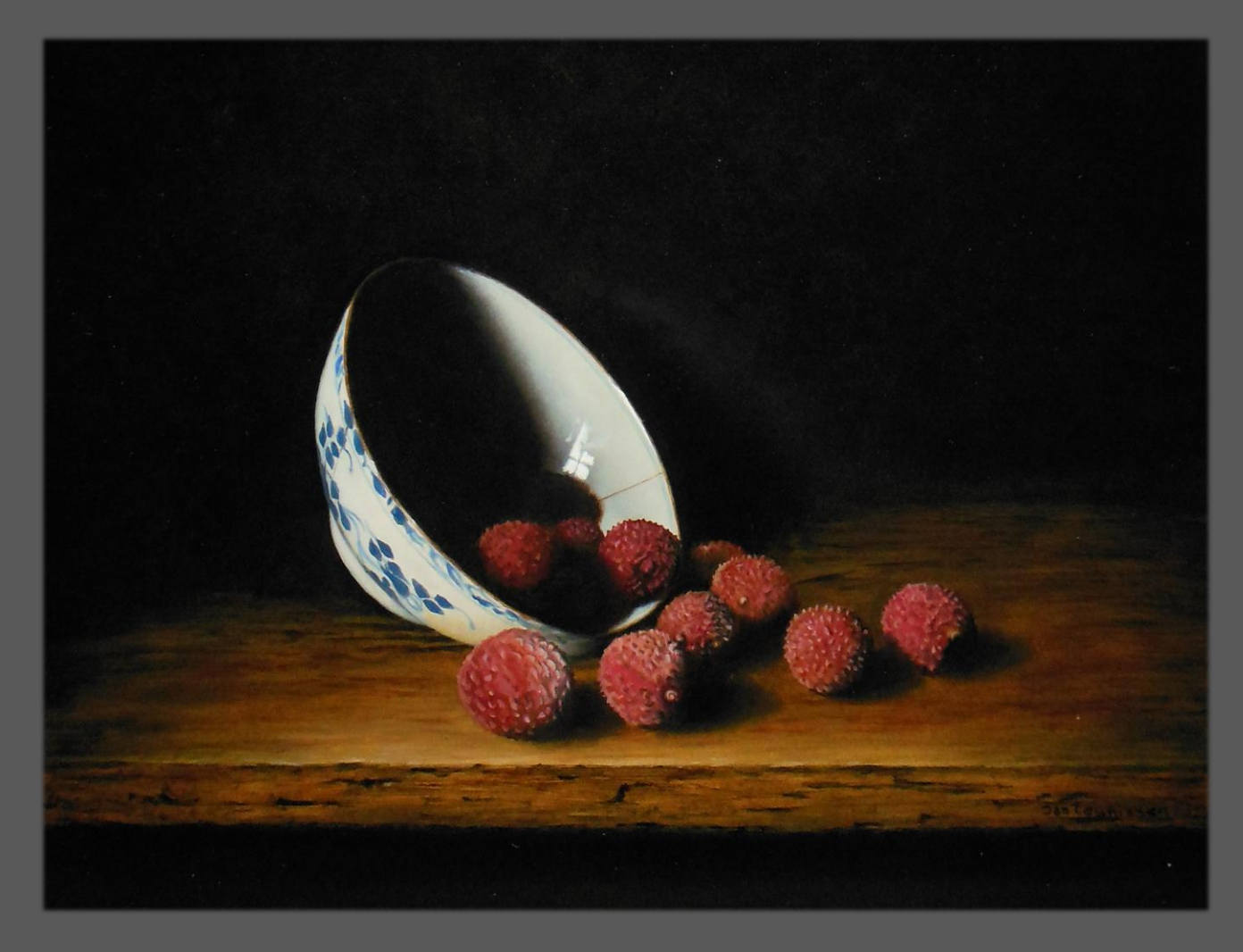
Chinese bowl with lychees (30 x 40 cm)