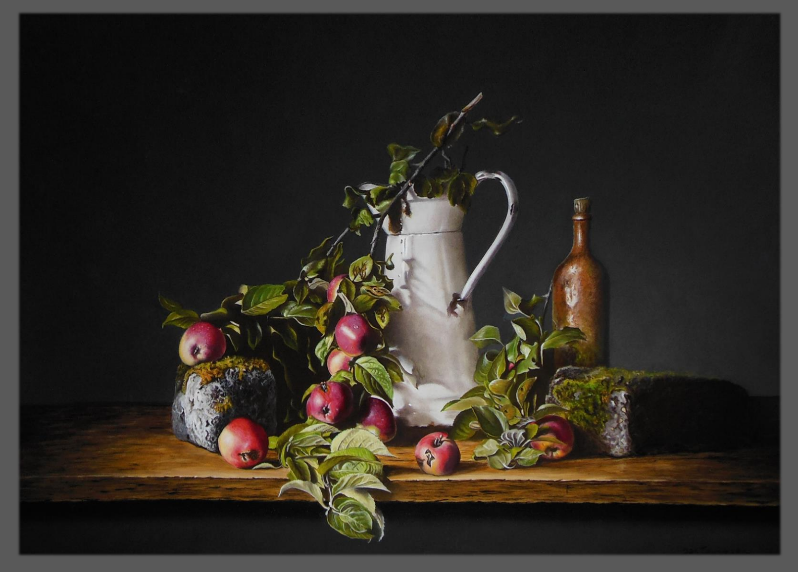
Still-life with apples mossy stone and white can (50 x 70 cm)