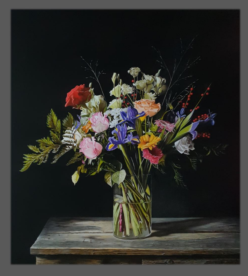
Colorful flower still life (100 x 90 cm)