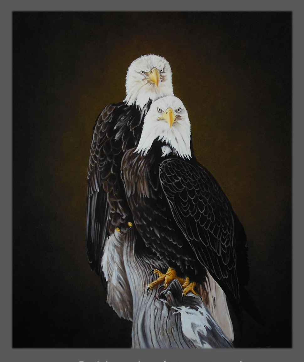
Bald eagles (60 x 50 cm)