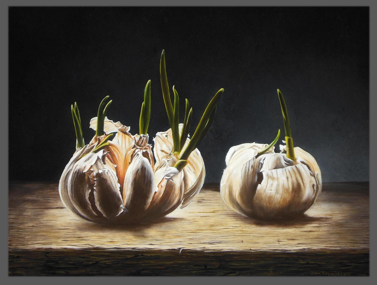
Garlic at is best (30 x 40 cm)