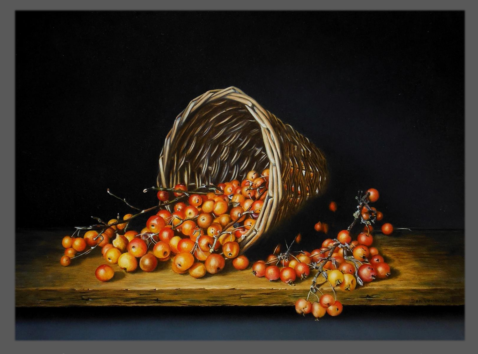
Still-life with basket and decorative apples (37 x 50 cm)