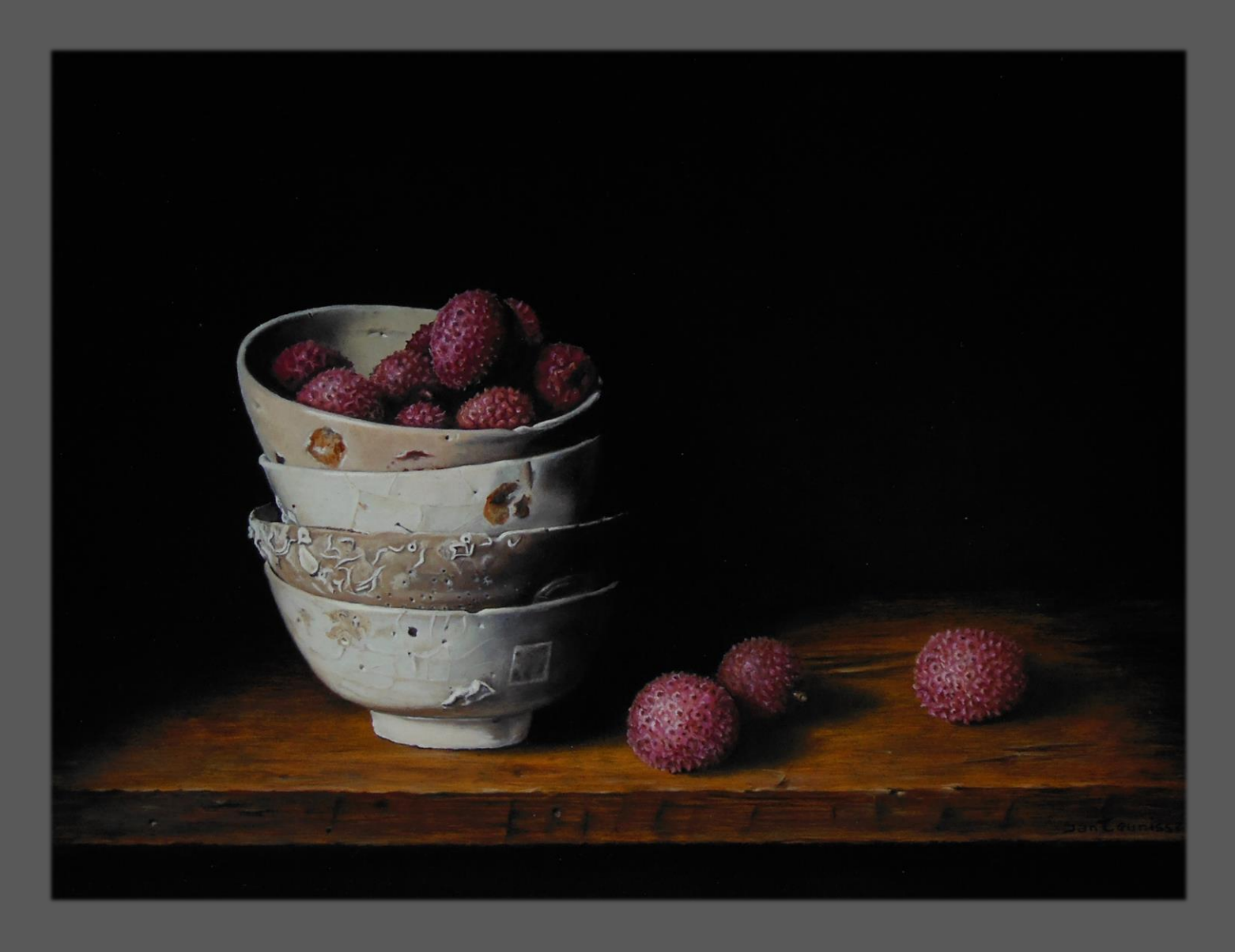
Still-life with Chinese bowls (30 x 40 cm)