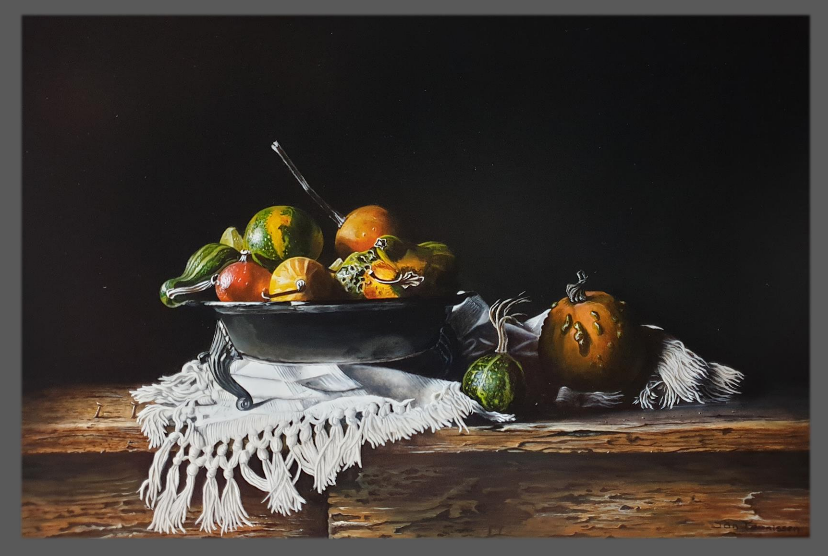
Pumpkins in pewter bowl (40 x 60 cm)