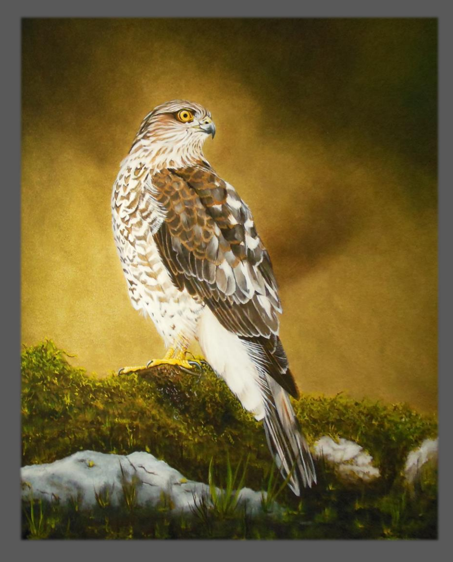
Sparrowhawk (50 x 40 cm)