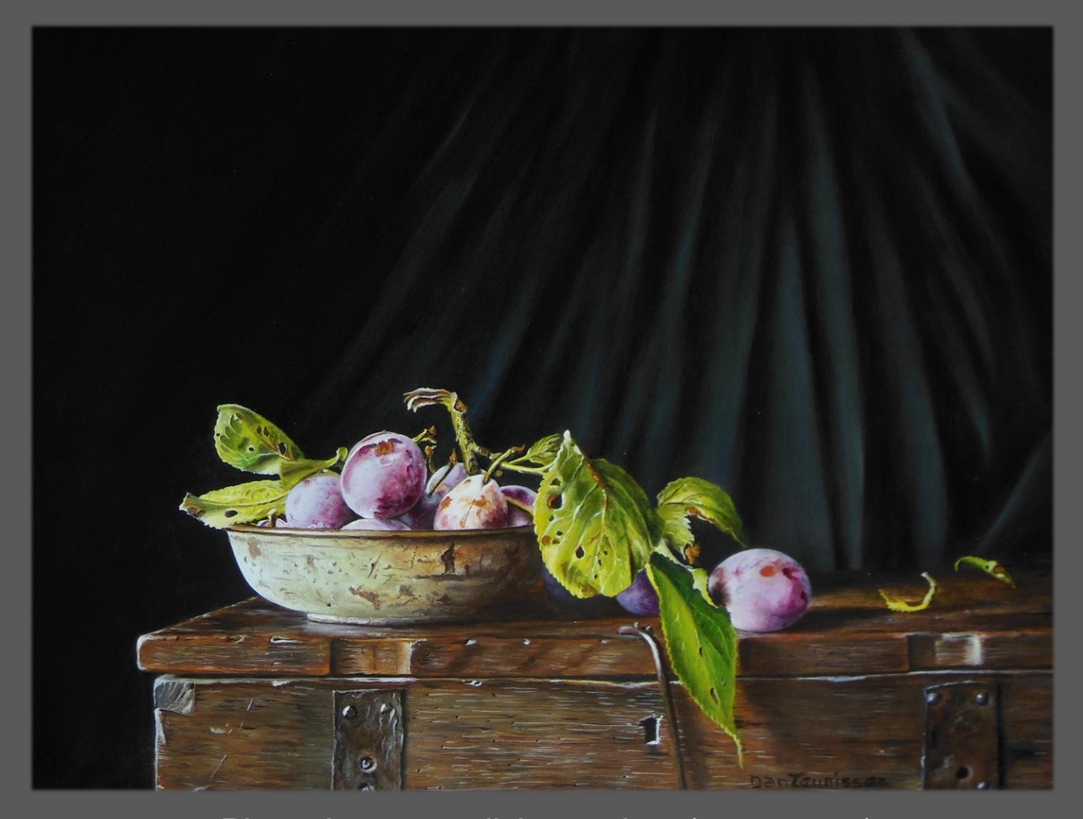
Plums in a rusty dish on a box (30 x 40 cm)