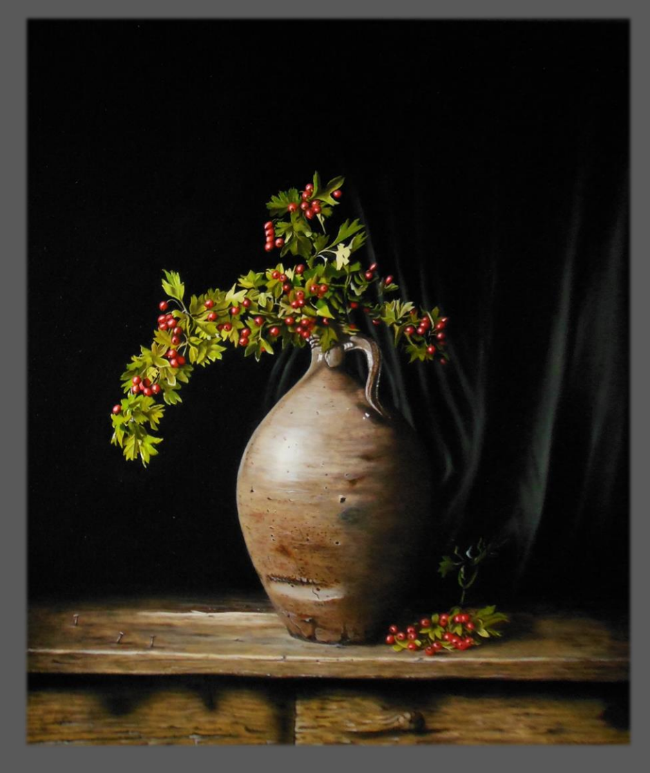
Vase with branch hawthorn berries (60 x 50 cm)