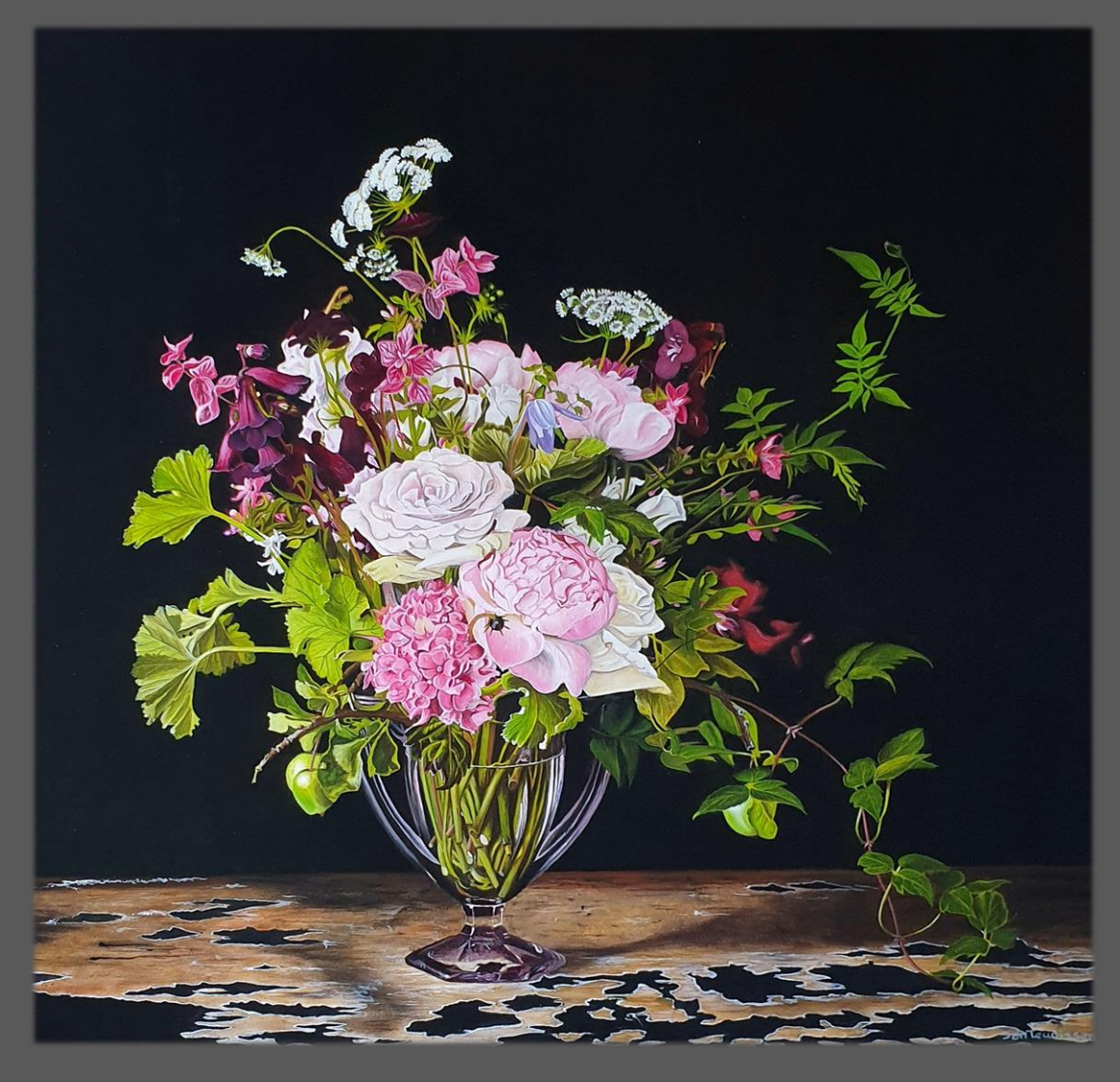
Flower still life with cow parsley (70 x 70 cm)