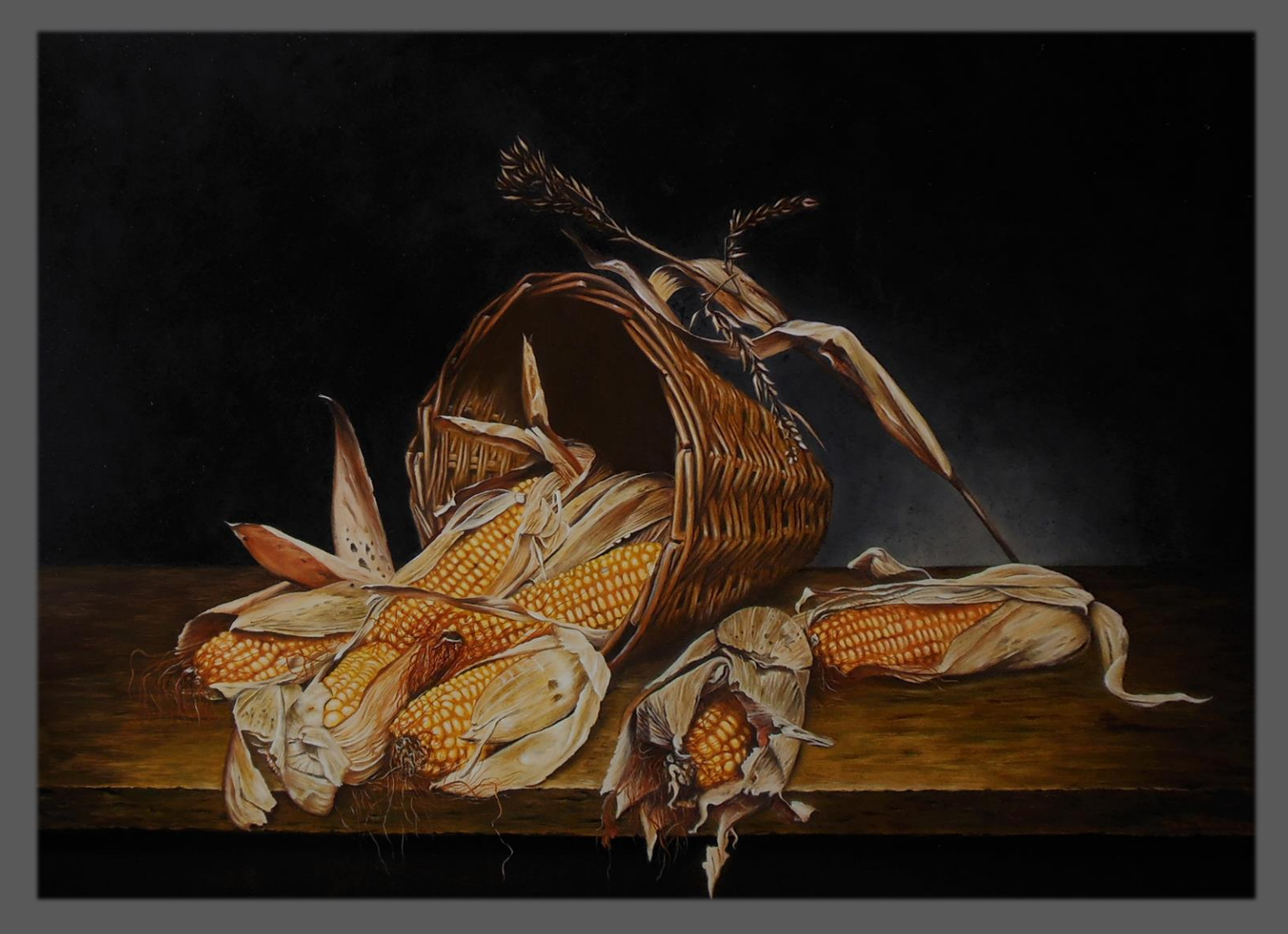
Still-life with basket and corn (50 x 70 cm)