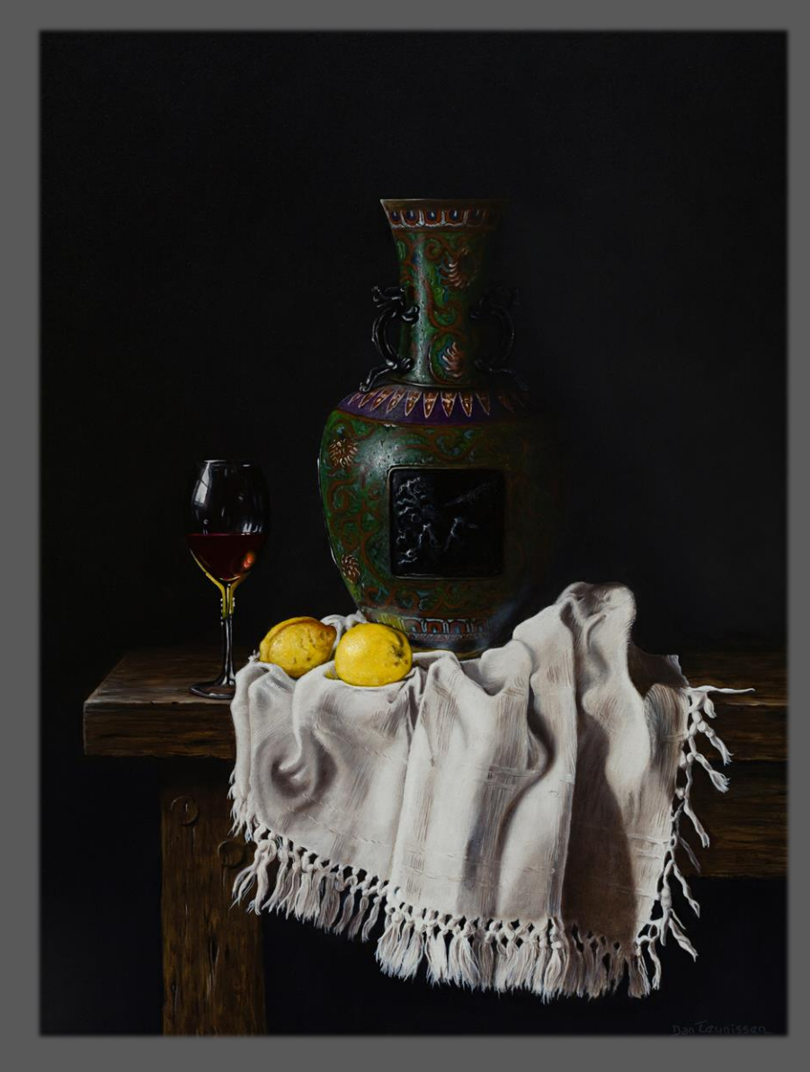
Still-life with Cloissone vase (60 x 45 cm)