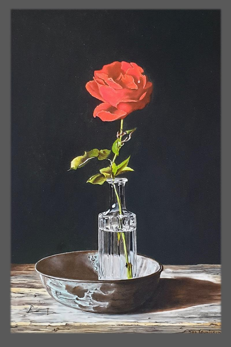
Rusty dish with red Rose in a vasen (45 x 30 cm)