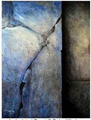
An Isolated Event © Duke Windsor